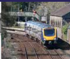
Northern class 195 leaving Carlisle © David Stubbins.

This guide provides information on train services across Cumbria and The Lake District.