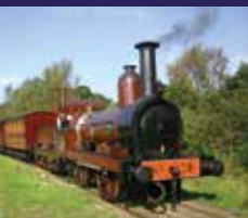
Furness Railway's No. 20

Visit communityrailcumbria.co.uk/projects or facebook.com/Cumbria175 to learn more and to join a series of events taking place throughout 2021 and 2022!