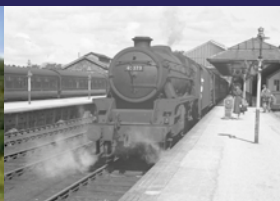
Steam at Windermere